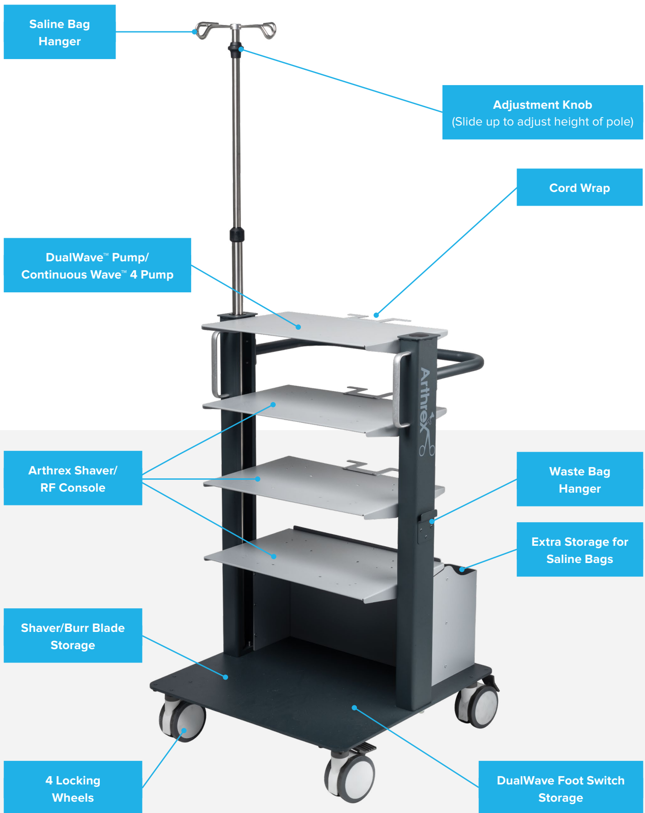
Pump Cart Features 1