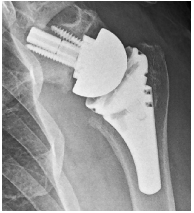
Inferiorly Flush Glenosphere