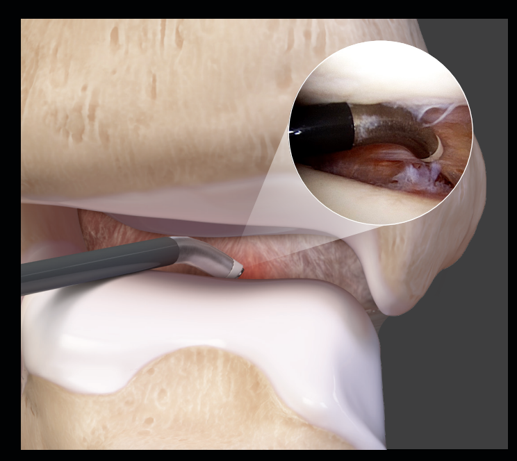
The Apollo<sup>8F</sup> SJ50 probe features an anatomically designed 50° curve, enabling the probe to fit over the talar dome and access the posterior aspect of the joint for precise tissue ablation.