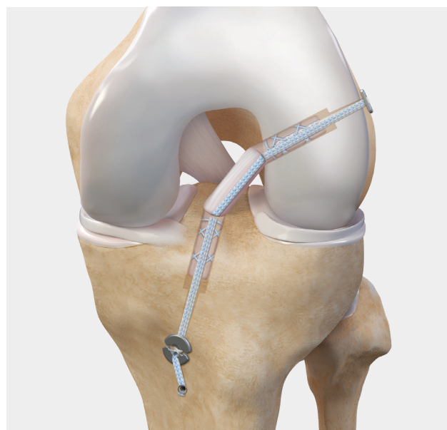
Concave 11 mm ABS button for the Internal/Brace technique